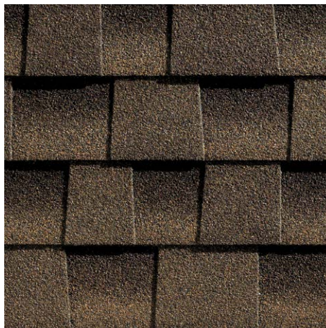
Beautiful finished look It's the same Timberline® Shingle you know and love, now even better