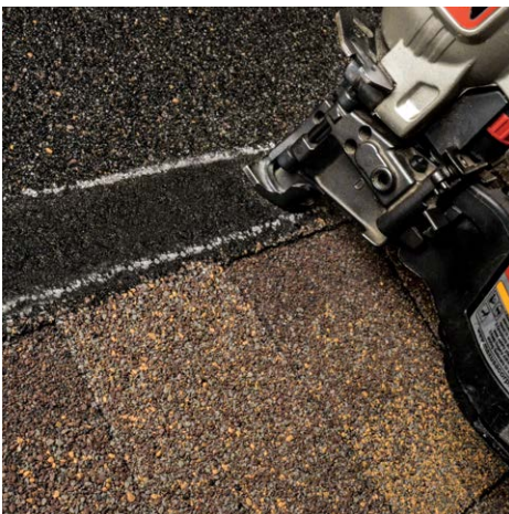
LayerLock™ Technology Powers the industry's widest nailing zone